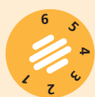
Output ▲ (mid AM)