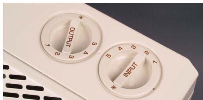
All storage heaters have input and output controls

Every storage heater has a set of simple controls. An input setting allows you to regulate the amount of heat that the heater stores during the night. This is important because, even though night-rate electricity is cheap, there's no point paying for more than you need. If it's not particularly cold, or you'll be out of the house for most of