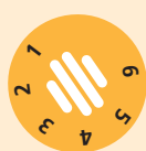
Output ▲ (early AM)