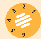
Input ▲ (night)